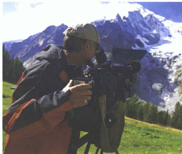
At the side, Valeria Golino, star of "Come il Vento", filmed in the Marche. Below, the Val d'Aosta set of the documentary "Chroniques d'en Haut"

diffusion of themes regarding rights and social justice".